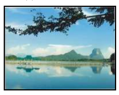
Plate (8) Zwekabin View