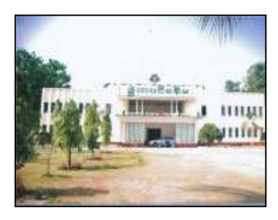
Plate (7) Zwekabin Hall