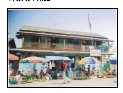
Plate (3) Administrative Office