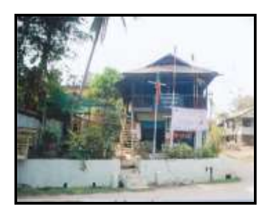
Plate (6) Administrative Office