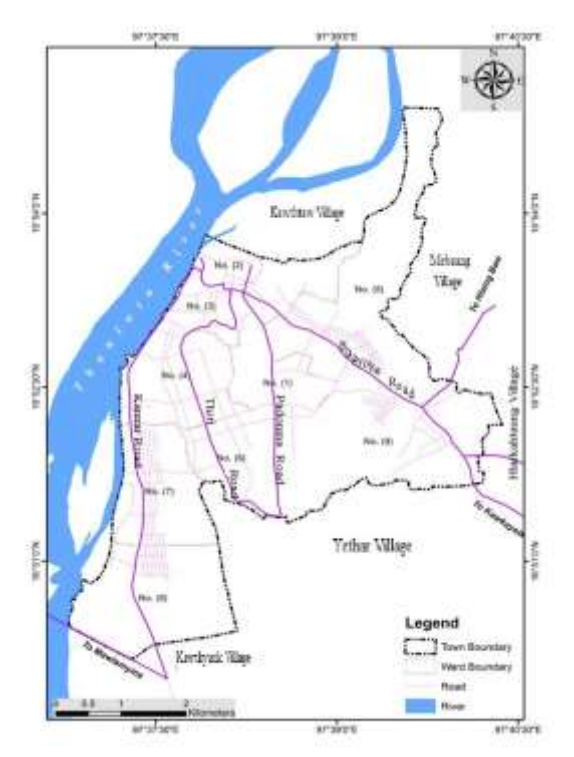
Fig. (2) Wards and Main Roads in Hpa-an Town